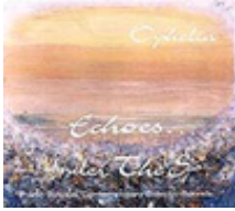
Echoes... Under the Sun CD