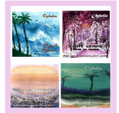
OHK CD/Fan Club Collection